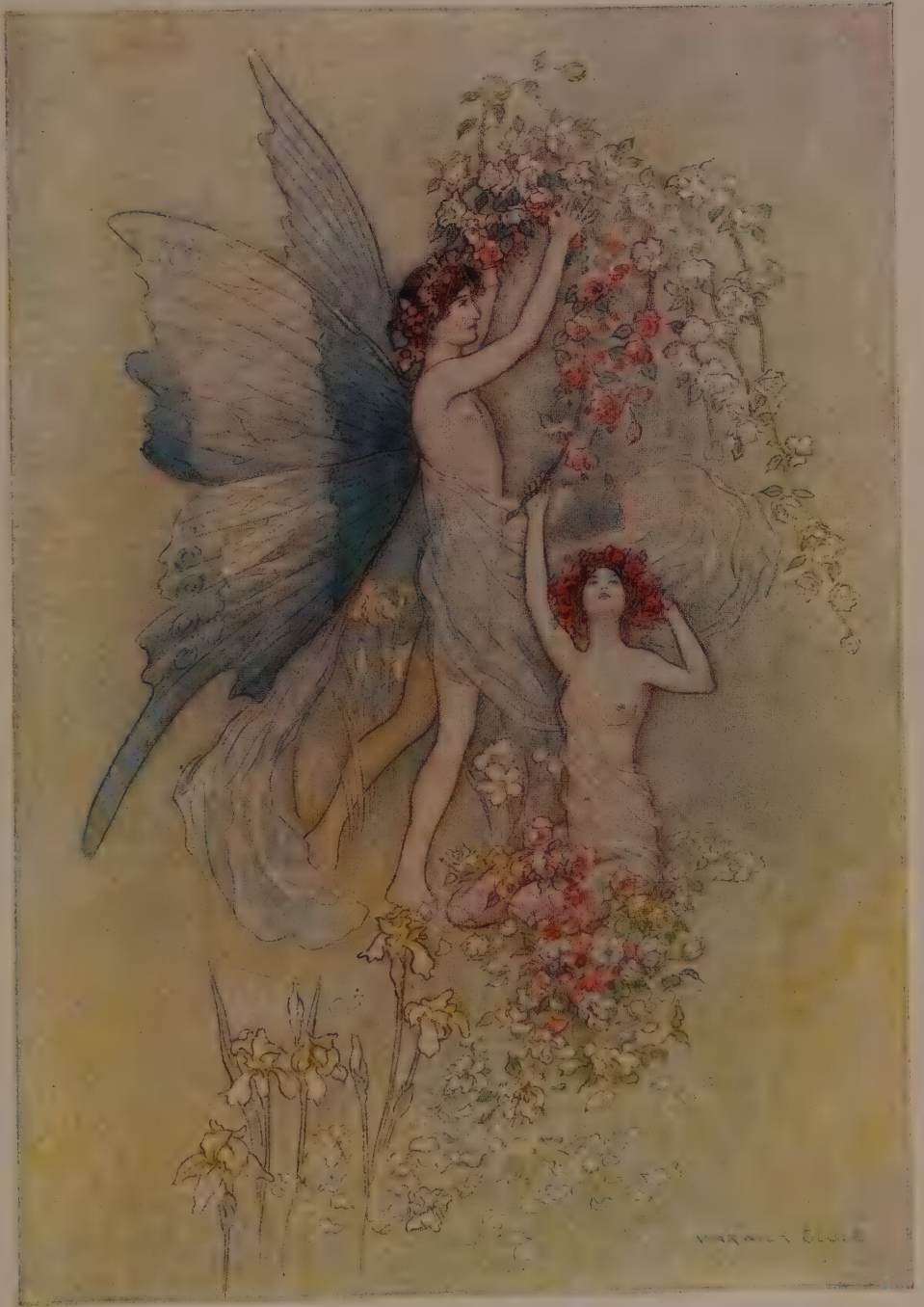
'FLORA AND ZEPHYR HAD FIXED THEIR DWELLING THERE'